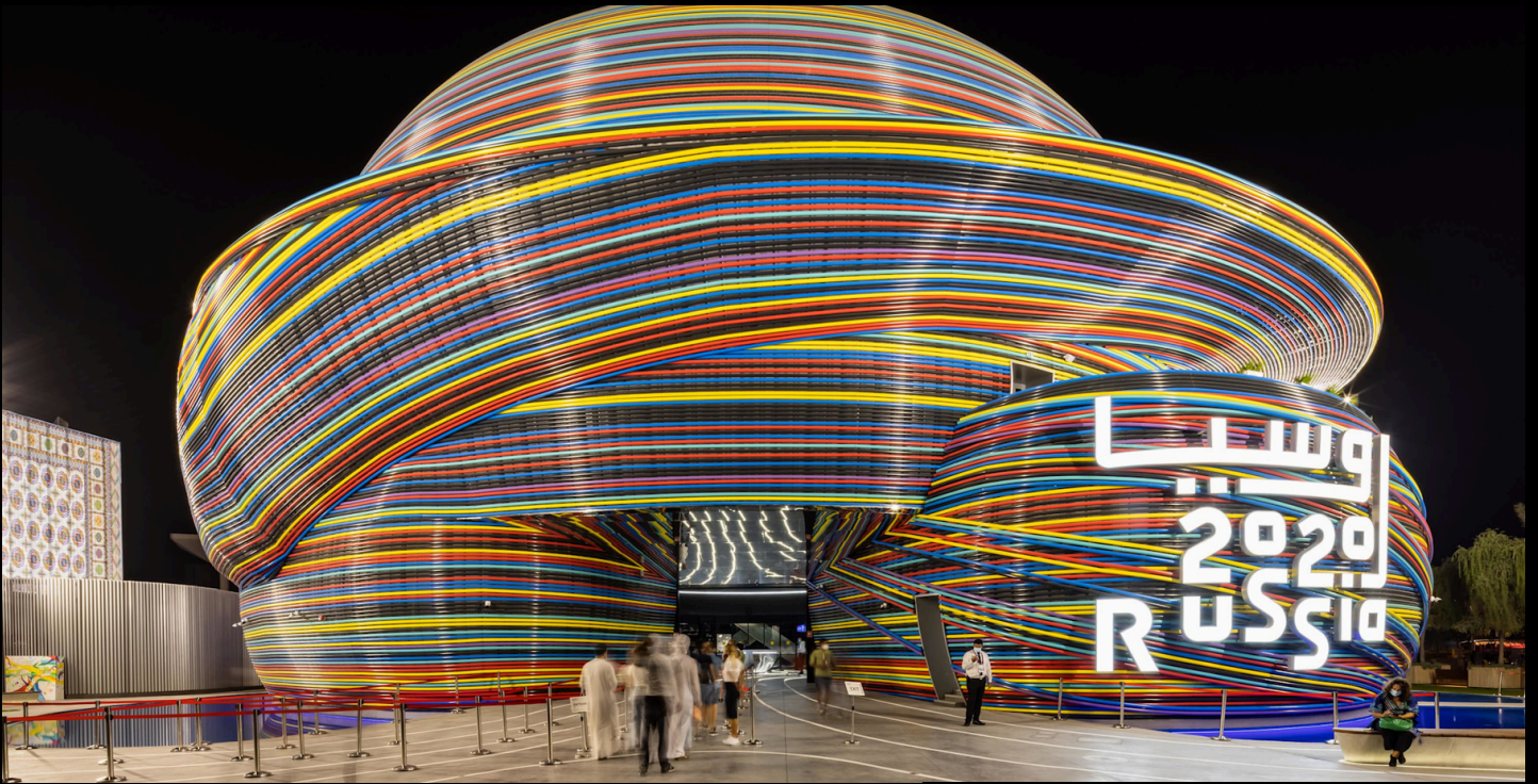
PROJECT: RUSSIAN PAV. EXPO