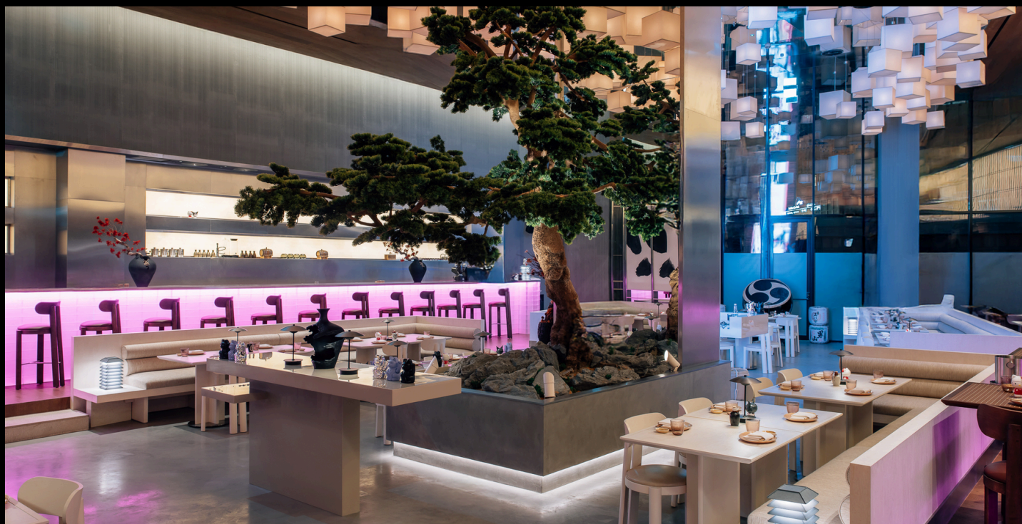
PROJECT: RAM&ROLL DUBAI