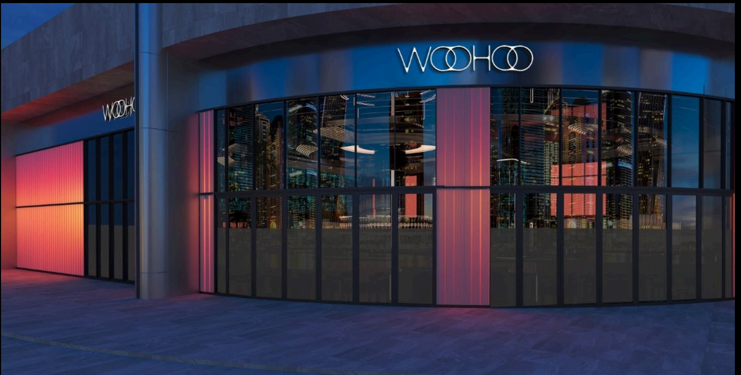
PROJECT: WOOHOO DUBAI