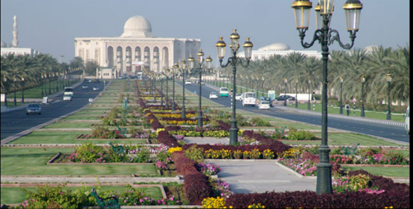
PROJECT: SHARJAH UNIVERSITY ROAD