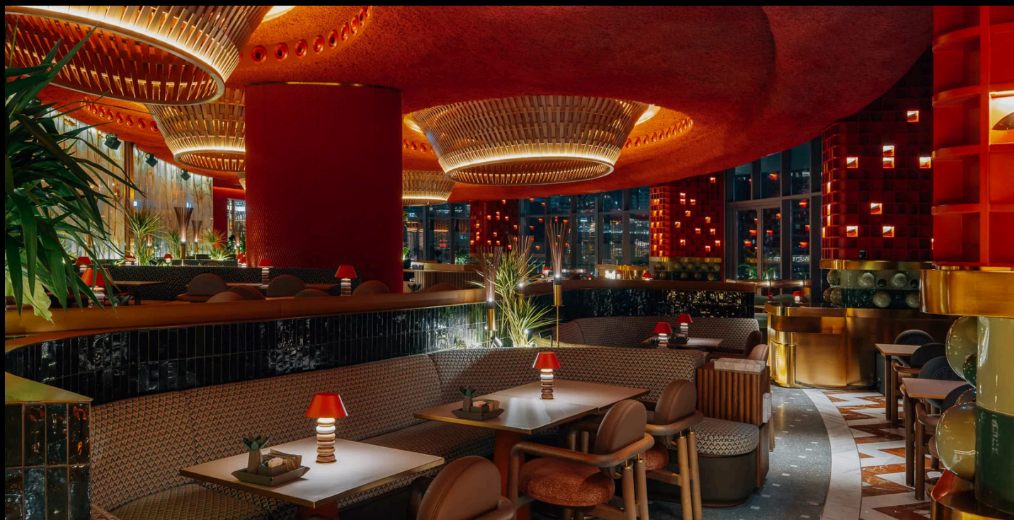
PROJECT: HUQQA DUBAI MALL