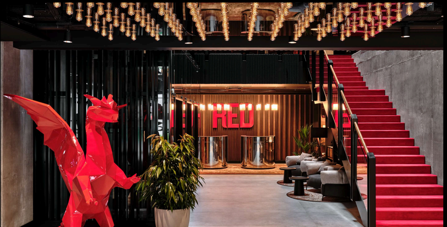
PROJECT: RADDISON RED HOTEL