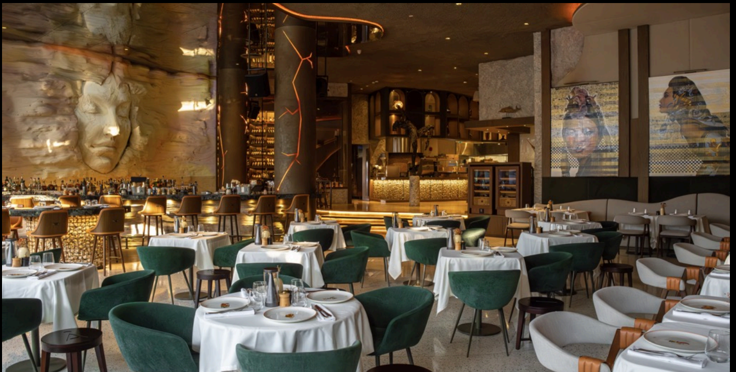
PROJECT: GAL RESTAURANT