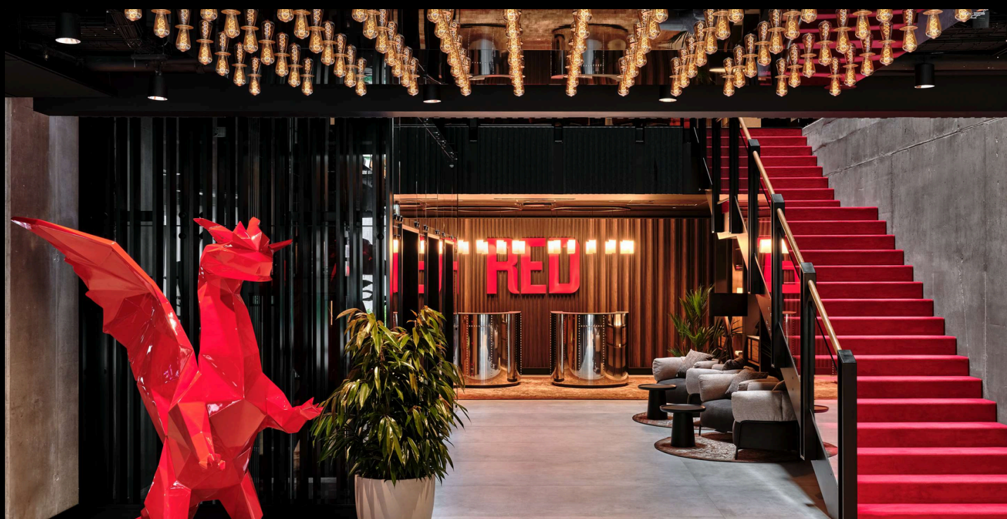
PROJECT: RADDISON RED HOTEL