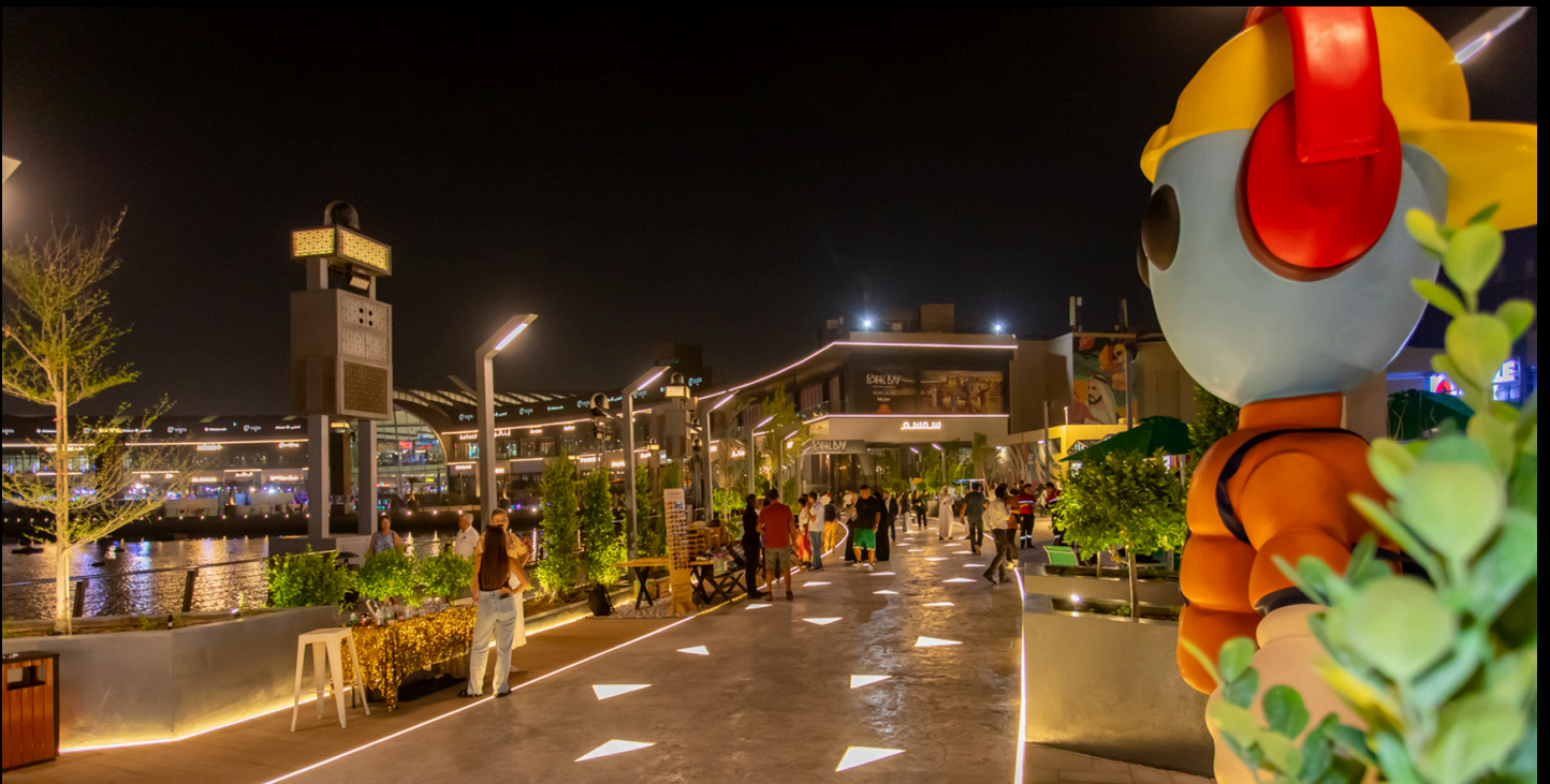
PROJECT: FESTIVAL CITY