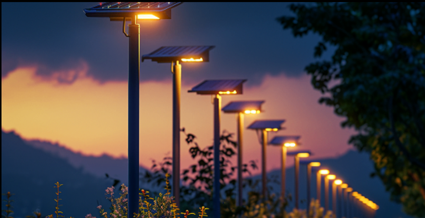
PROJECT: RAK PUBLIC PARKS