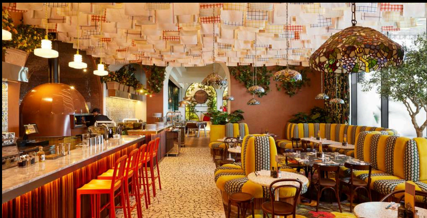
PROJECT: MAMASHELTER HOTEL