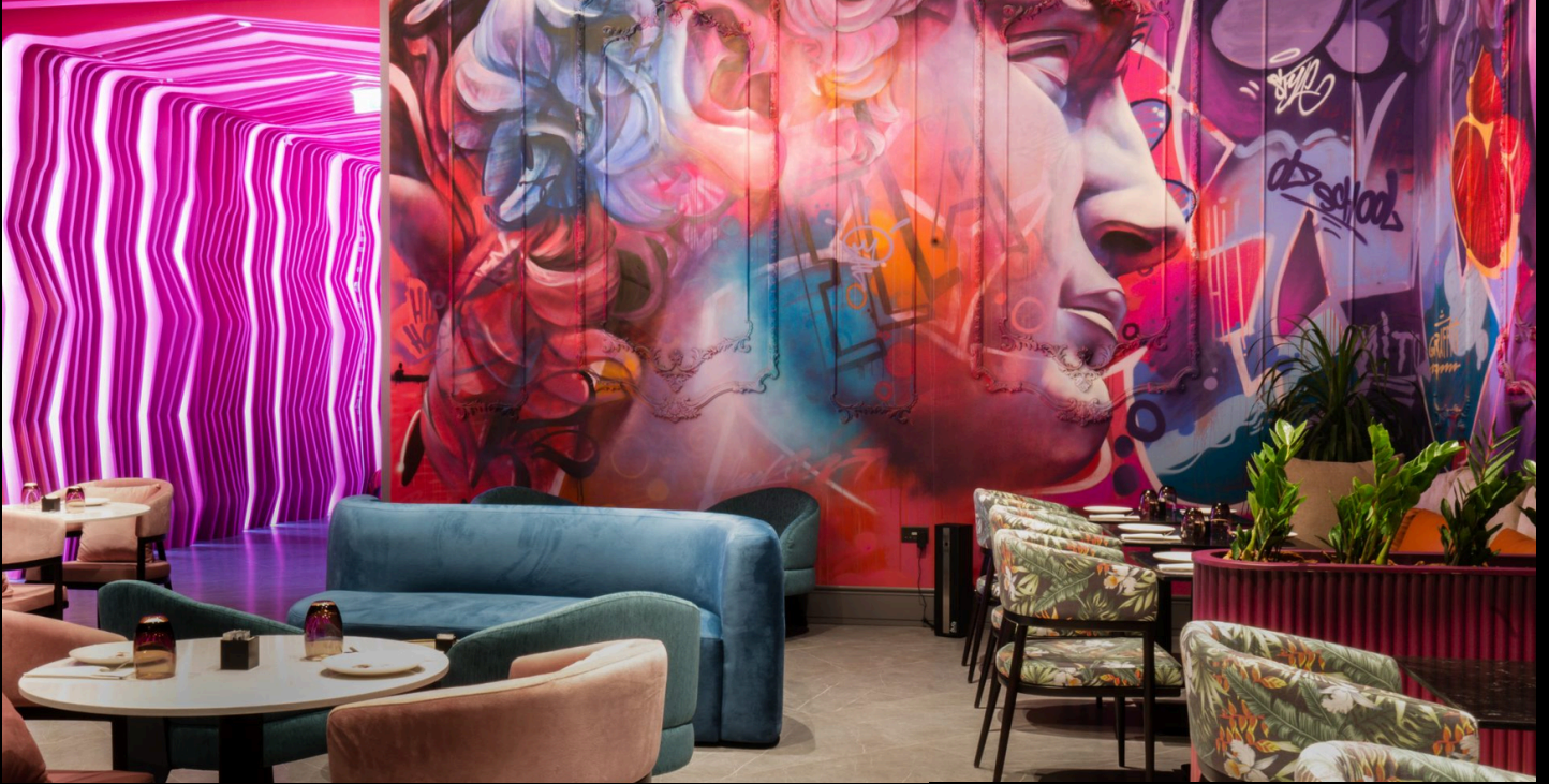
PROJECT: TROVE RESTAURANT