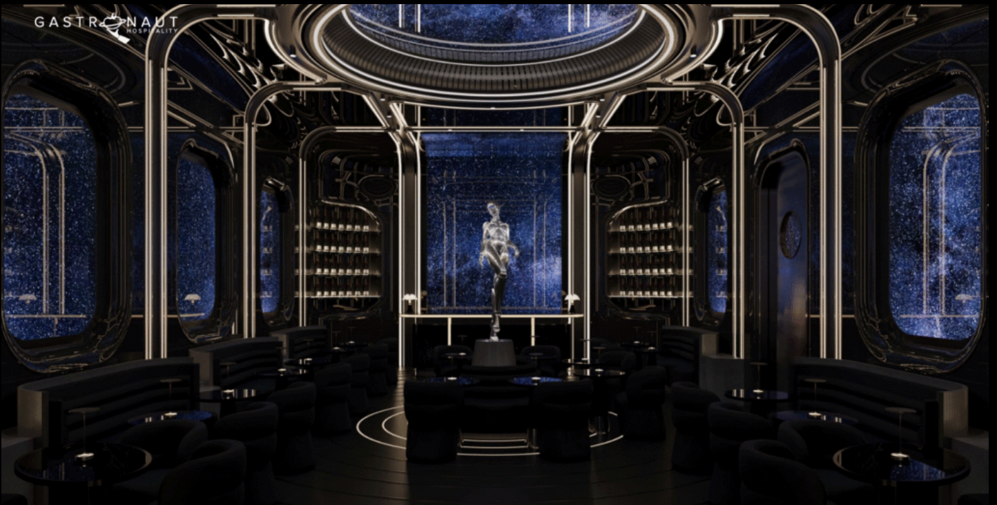
PROJECT: SPOCK DUBAI