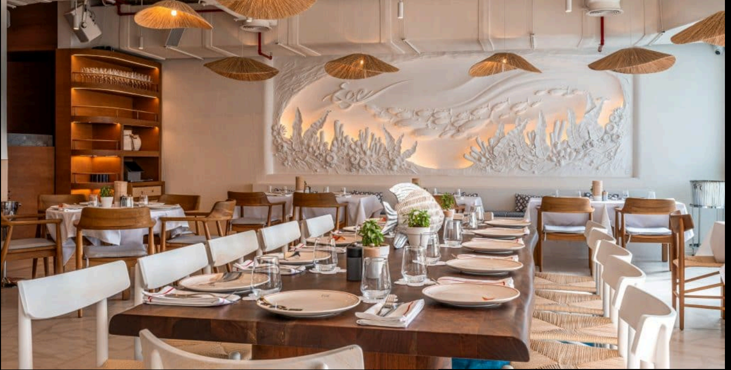
PROJECT: EGE RESTAURANT