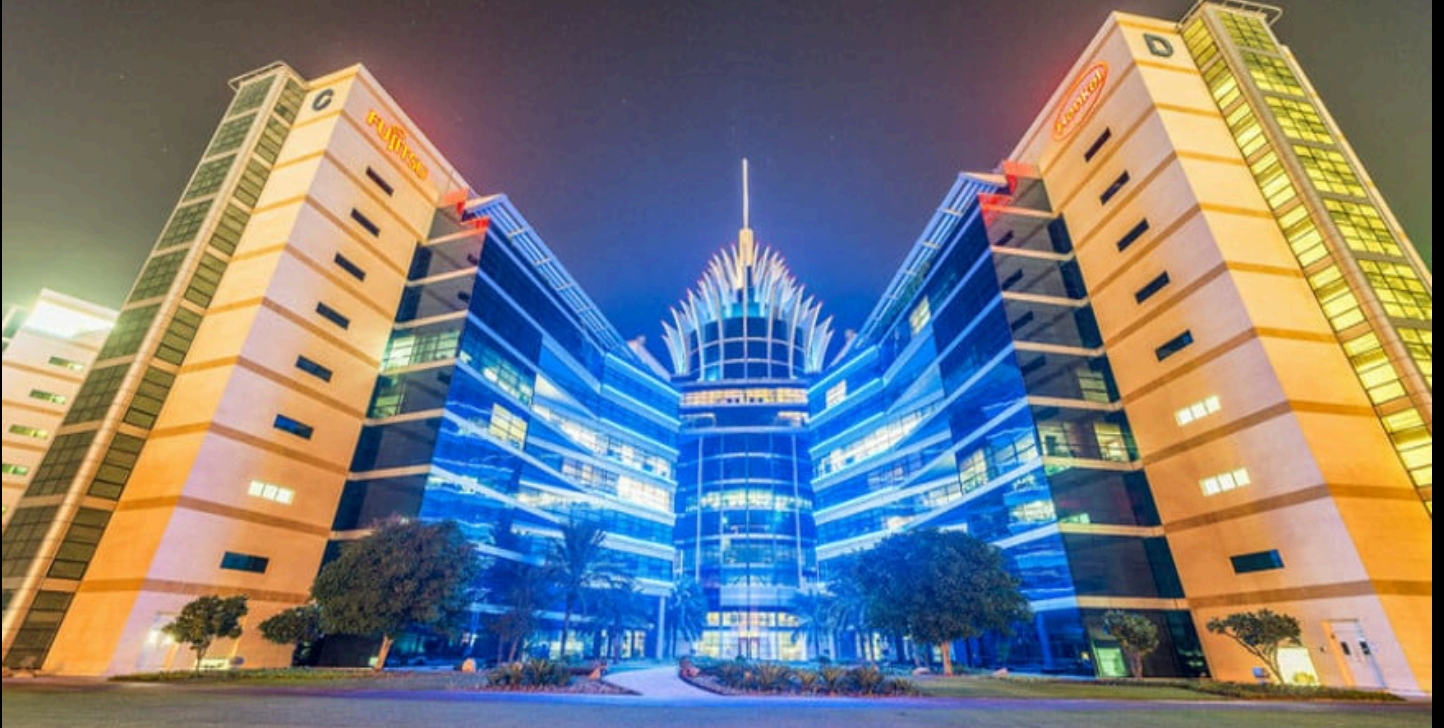
PROJECT: SILICON OASIS