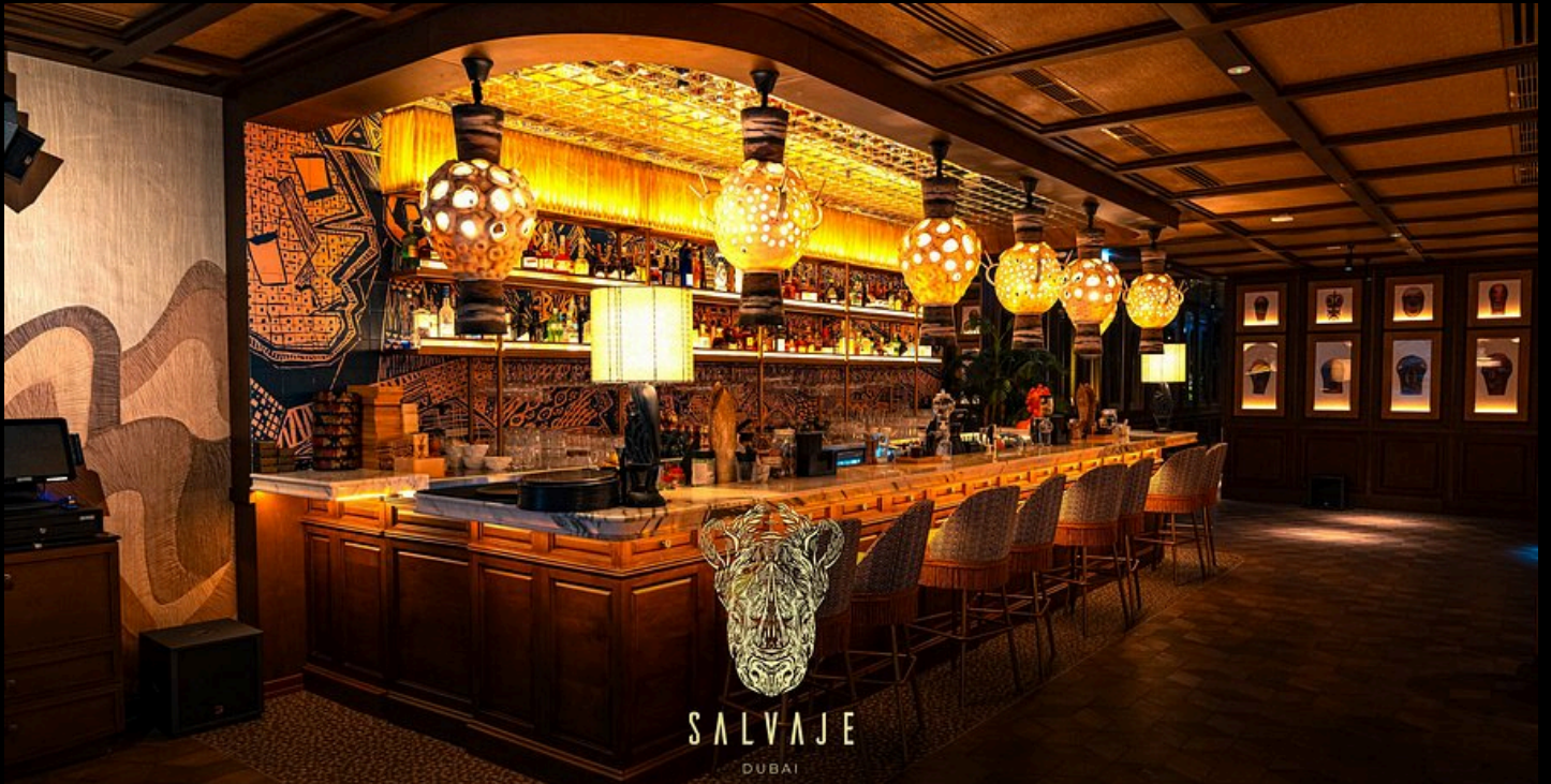
PROJECT: SALVAJE RESTAURANT